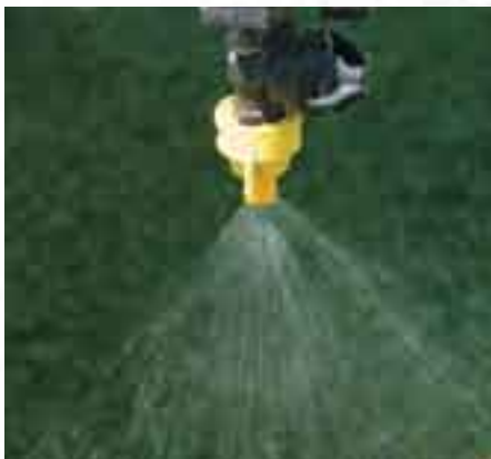
AirMix® OC off-centre nozzle