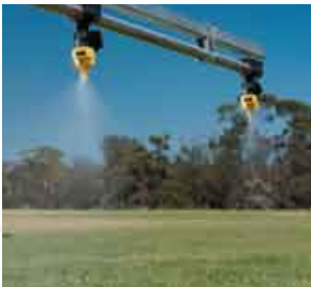
Typical 2-nozzle boom setup